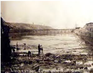
Construction of the Livingstone Channel in the Detroit River.

The Middle Channel reefs are designed to benefit several fish species that are threatened or endangered in Michigan, including lake sturgeon, mooneye, northern madtom catfish and river redhorse sucker. Popular sport fish walleye and commercially important lake whitefish will also benefit. Many of these fish migrate great distances from where they are born, therefore the Middle Channel reefs will enhance fish communities in lakes St. Clair, Erie and Huron.